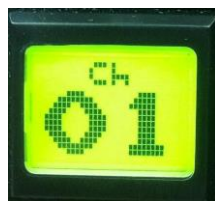
Figure 3: Receiving Data