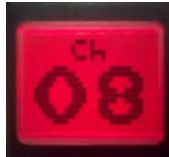
Figure 4: Not Receiving Data