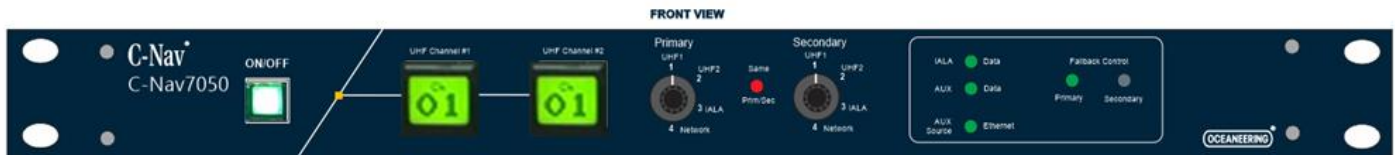
Figure 2: C-Nav7050 Front Panel

This section provides guidance on operating the C-Nav7050. Figure 2 (Page 9) shows the front panel of the C-Nav7050 with its buttons, switches and indicators.